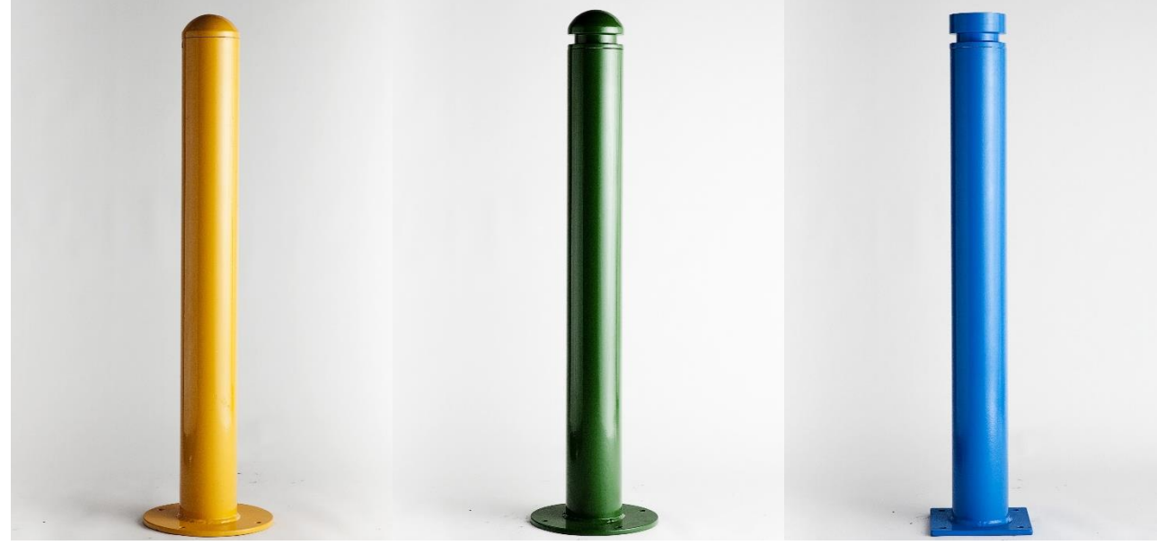
EM435 Slimline Dome Bollard with round base plate option